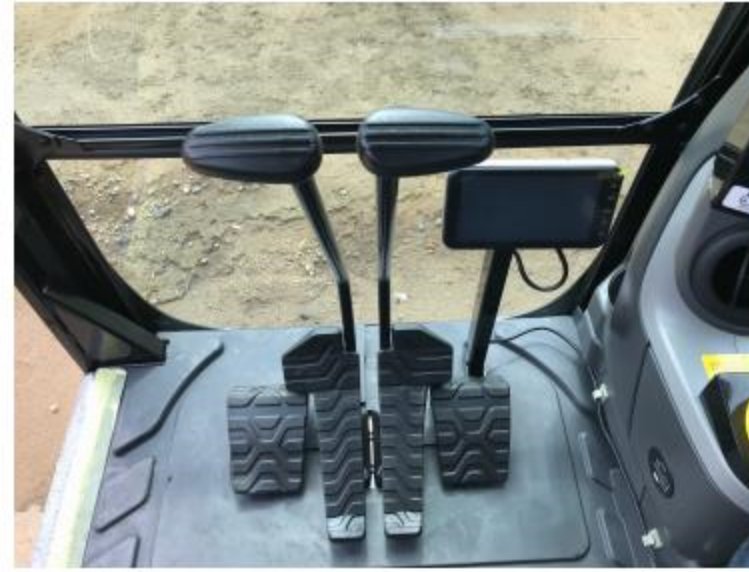
Two driving Lever