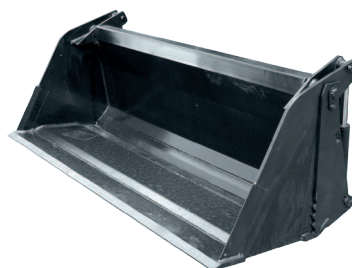
Bucket 4 in 1